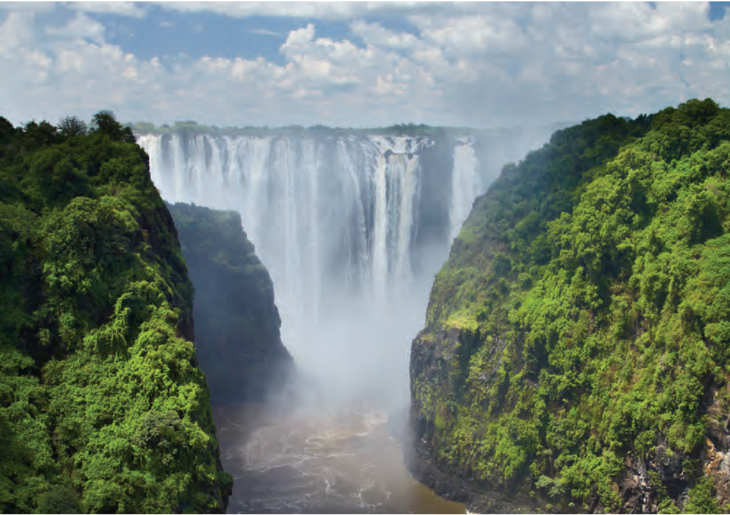
Victoria Falls, the “smoke that thunders”

embark on a game-viewing boat safari on the Chobe River, where we may see hippos, crocs, and some of the park’s 450 species of birds (including the sacred ibis, carmine bee-eaters, fish eagles, and kingfishers). We dine tonight at our lodge. B,L,D