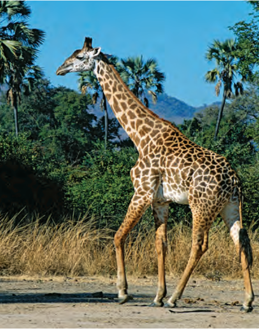
South Luangwa giraffe

Day 13: South Luangwa National Park/Lusaka/ Depart for U.S. We travel by light aircraft today