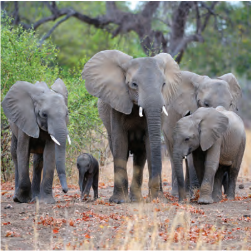
Chobe boasts the world’s largest elephant population

to Lusaka, Zambia’s capital, where we have hotel day rooms until our departure this evening for the airport and our overnight flight to the U.S. B