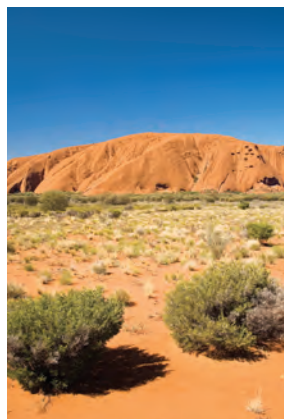
Aboriginal site of Uluru (Ayers Rock)

worms that illuminate the underground grottoes and caves. We reach Auckland late this afternoon; we're on our own for dinner tonight. B