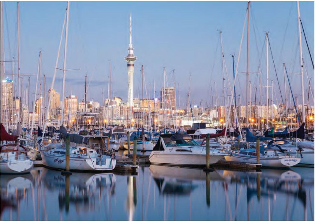
We spend two nights in Auckland, New Zealand’s largest city.

up at Michaelmas Cay where we can swim, snorkel, or view the reef from a semi-submersible vessel. B,L