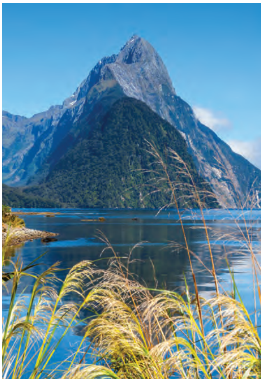
On Day 16, we cruise on Milford Sound.