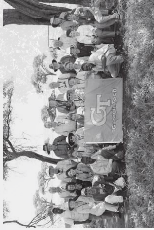
Georgia Tech Alumni on Orbridge's Tanzania Wildlife Safari.

PRSRT STD U.S. POSTAGE PAID PERMIT NO. 825 SAN DIEGO, CA