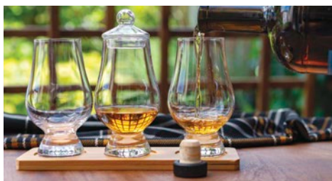
Top: Cliffs of Moher | Above: Irish whiskey tasting