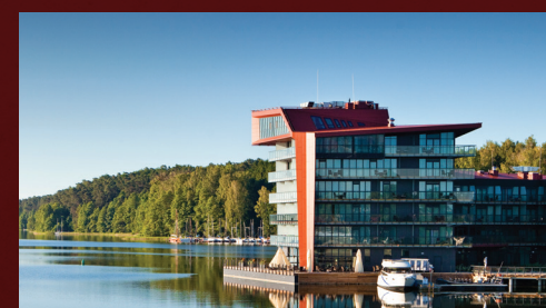
Hotel Mikołajki Bird Island, Mikołajki, Poland