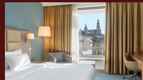
Radisson Blu Kraków Kraków, Poland