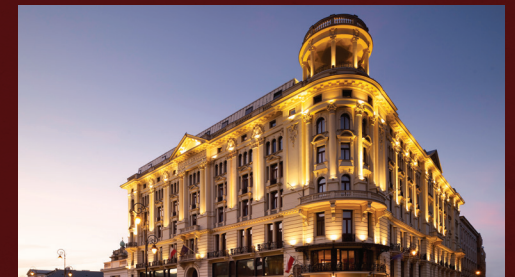
Hotel Bristol Warsaw, Poland