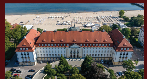
Sofitel Grand Sopot Sopot, Poland