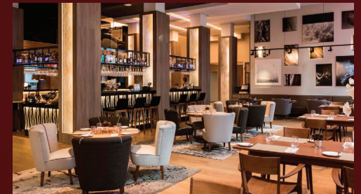
AC Hotel by Marriott Wrocław Wrocław, Poland