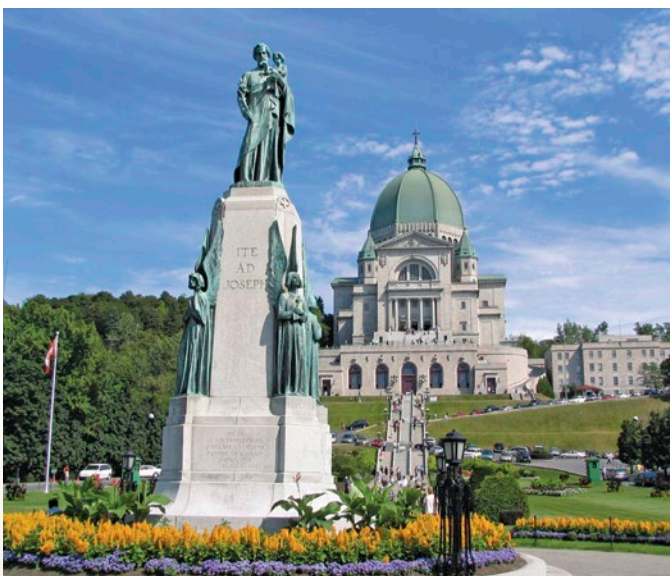
St. Joseph's Oratory, Montreal