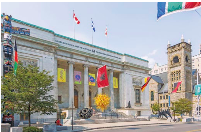
Montreal Museum of Fine Arts campus (Bourgie Hall at right)