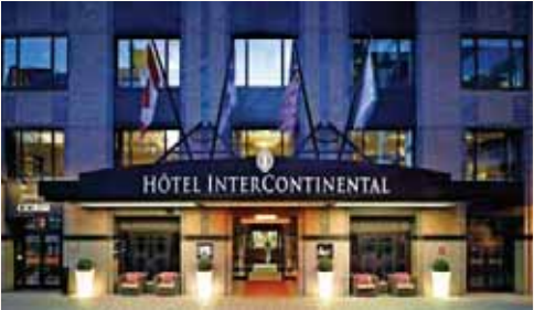
InterContinental Montreal | Montreal