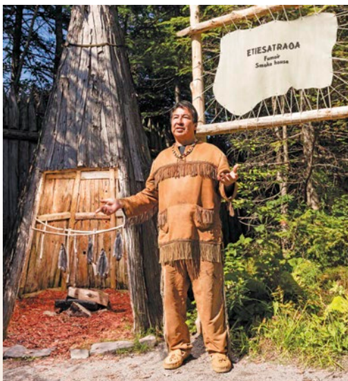
Traditional Huron Site, Wendake Huron reserve