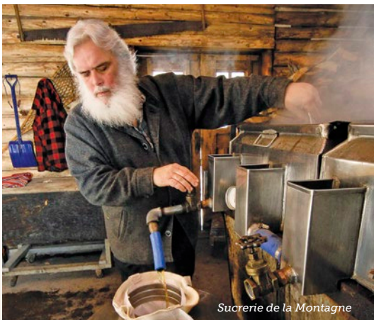
Sucrerie de la Montagne

Old Montreal Walking Tour. Canada's second-largest city was founded in 1642 by a group of French Catholics on an island where the St. Lawrence and Ottawa rivers converge. Today, Montreal is one of North America's most cosmopolitan cities, fiercely proud of its French heritage and imbued with a charismatic blend of Old-World ambience and modernity. Stroll to see the Place d'Armes, dominated by the