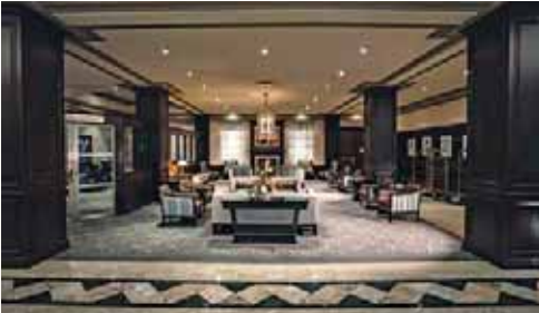
Lord Elgin Hotel | Ottawa