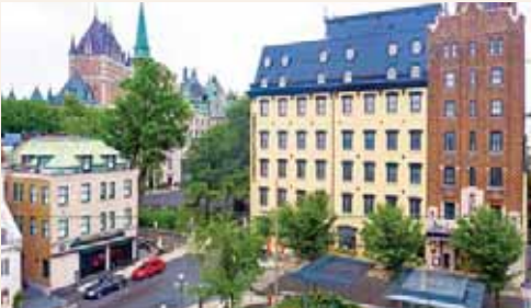
Clarendon Hotel | Québec City